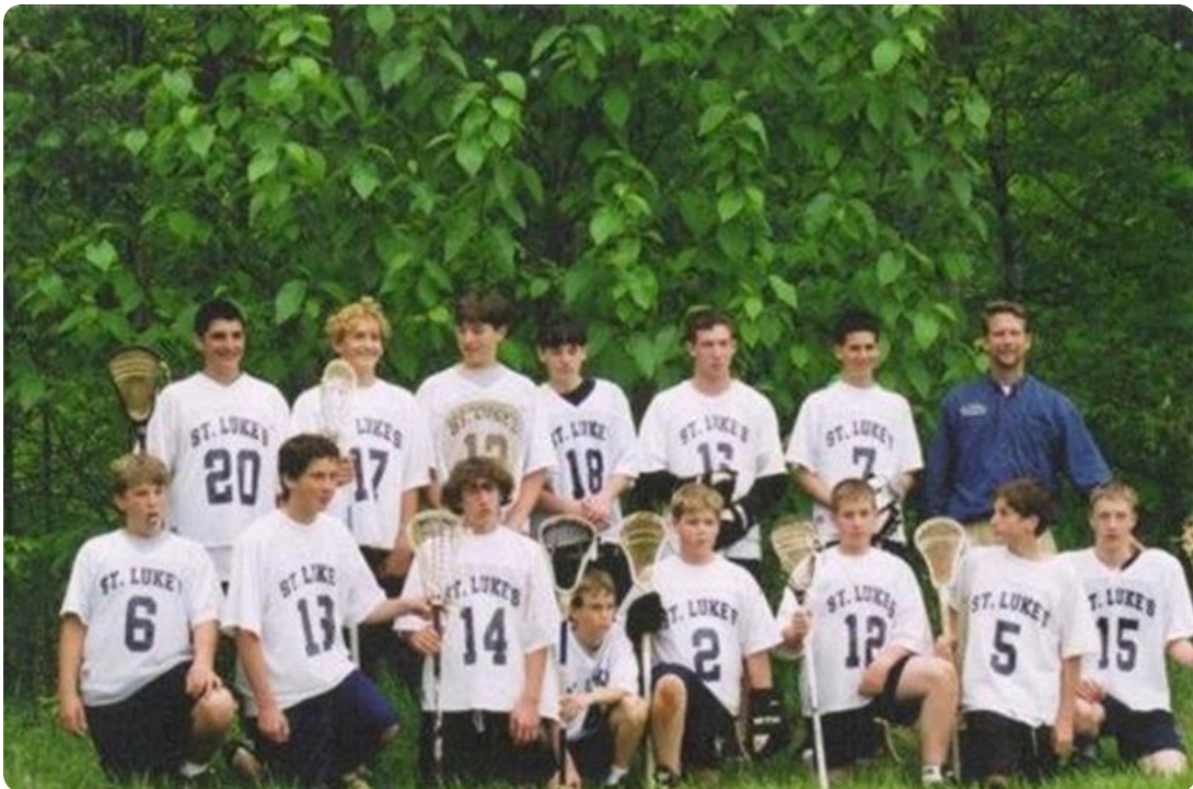
St. Lukes Lacrosse